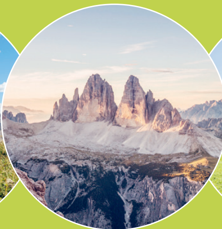
Tre Cime Drei Zinnen Three Peaks